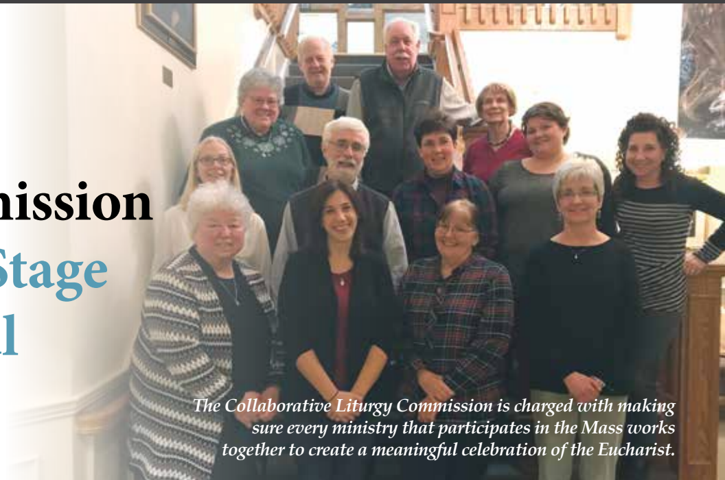
The Collaborative Liturgy Commission is charged with making sure every ministry that participates in the Mass works together to create a meaningful celebration of the Eucharist.

Whether we take the time to realize it or not, each element of the Mass is specifically chosen to help set a mood and a tone for the liturgical year. Elements like vestments, altar cloths, objects around the altar and music we hear help the faithful enter into the world created by the liturgical movement, which is meant to draw us deeper into our love for the Lord.