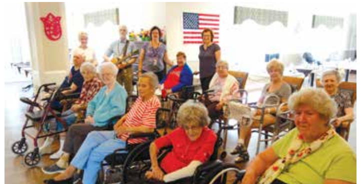
Westford House residents and Nursing Home Rosary Ministry volunteers share in faith and fellowship during one of their weekly gatherings.